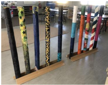
Installation piece to be displayed in the Senior building middle room.

Students have been very busy last week, working primarily with paint, tissue paper and glue. Here are some great examples of creativity.