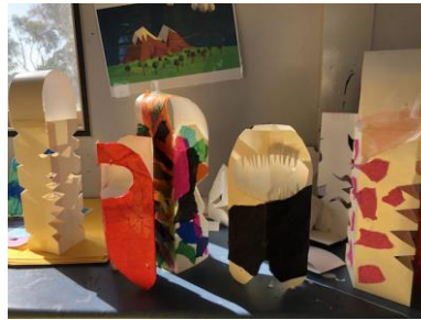
Lamps by Senior Students repurposing Plant guards.