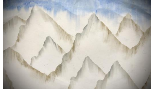
'Mountain View' by Brock Stewart.