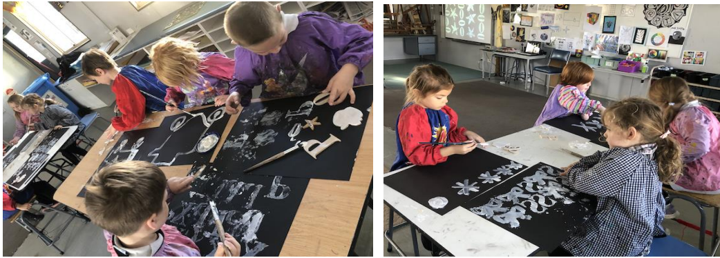
Students from Miss Cock's class 'printing with paint'.